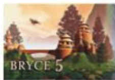
Create your own digital world.