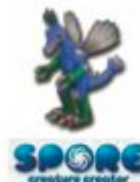
SPORE creature creator