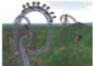
Ride on a virtual roller coaster that YOU design and build!

Camp Internet: Extreme , entering its 17th awe-inspiring year, offers students access to top-of-the-line 20" flat screen iMac computers, a wide variety of cutting edge multimedia equipment, and two certified teachers with 29 years of combined technology teaching experience. Campers will have an opportunity to use these resources to produce content for a DVD, produce virtual reality environments, design and manipulate digital video, create 3-D images, create animation, design their own animated creature, create studio quality music, and gain life-long technical skills that can be used in the home and classroom. Campers will work on their own computers to generate daily projects using the wide variety of media tools available. All campers will leave with their own DVD of camp-produced work. For grades 3-10. The Camp Internet instructors will teach your child to become comfortable using technology as a tool for learning. Camp Internet is designed to provide your child with a powerful, state of the art multimedia iMac computer, access to proven educational programs, and direct high speed internet access.