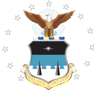
Air Force Colorado Springs