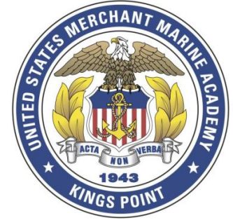
Merchant Marine Kings Point

Thursday, 18 October 2018, 6-8 pm Chugiak High School Commons