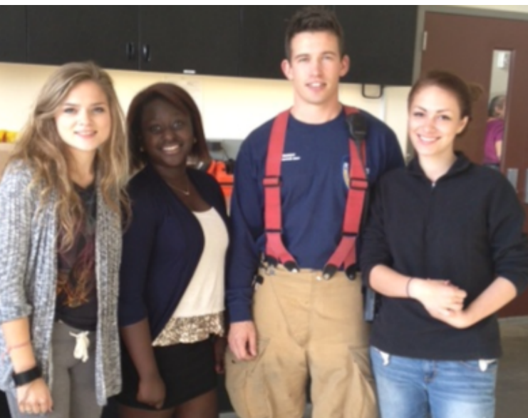
Steller students stepped up to volunteer for Station 5 Open House.