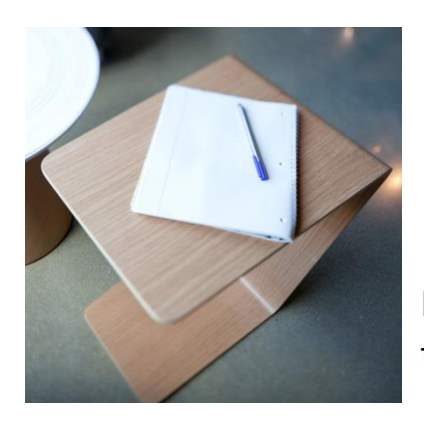
Example of the laptop table for Areas 1,3 & 4