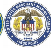
Merchant Marine USMMA

Thursday, 19 October 2017, 6-8 pm Eagle River High School, Academic Quad