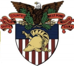
West Point USMA/Army