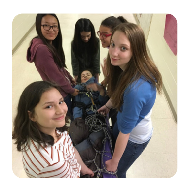
Learning rescue skills for Intensives